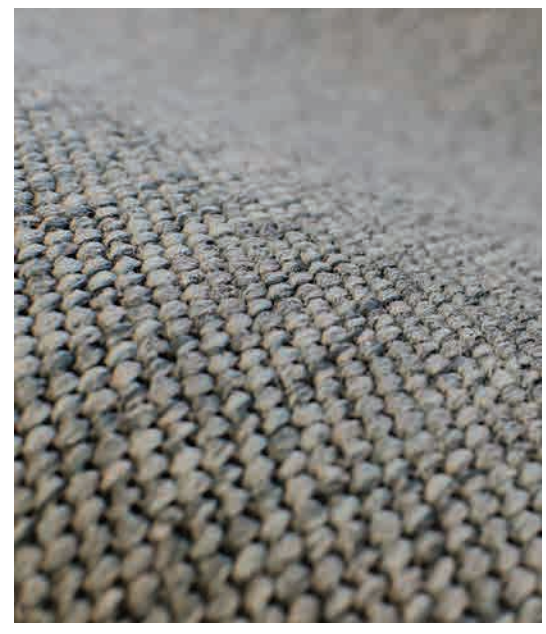
Carpet Concept's Eco Cut 4m width carpet or tiles combine the character of a soft loop pile carpet with the design possibilities of flat weaving technology in a choice of two patterns in 29 colours