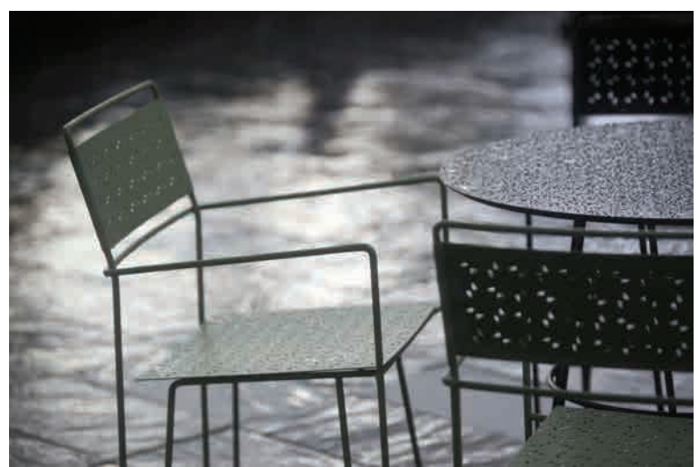
Steel by Göhlin debuted its first outdoor pieces: Chair No 1 Outdoor and the Saturnus table, with a laser cut pattern on the seat, backrest and tabletop, inspired by nature and the elements, such as the sun, stars and seeds.