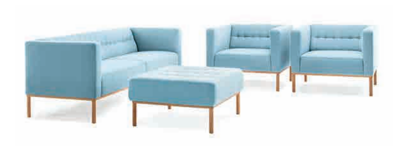
Flötotto debuted its first upholstery design: Otto, by Claesson Koivisto Rune. The sofa is available as a two, two and a half and three-seater, with an oiled oak frame.

The number of overseas visitors to the Stockholm Furniture and Light Fair (7-11 February) rose 6.5% to 10,000 as the show reinforced its position as the largest meeting place for Scandinavian design. Next year's show takes place from 6-10 February. Visit: www.stockholmfurniturefair.com