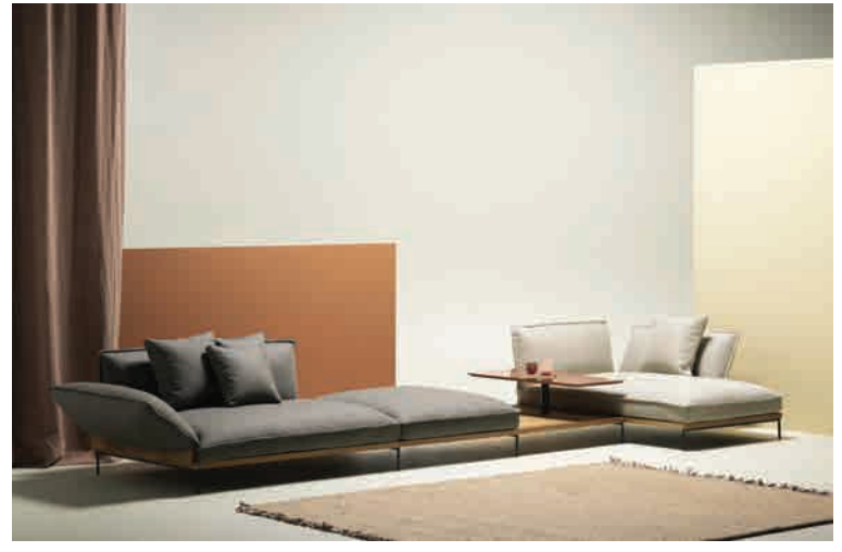
Luca Nichetto combined Swedish and Italian influences for Fogia's Jord upholstery. The base is walnut and the integrated table can have an optional marble top.